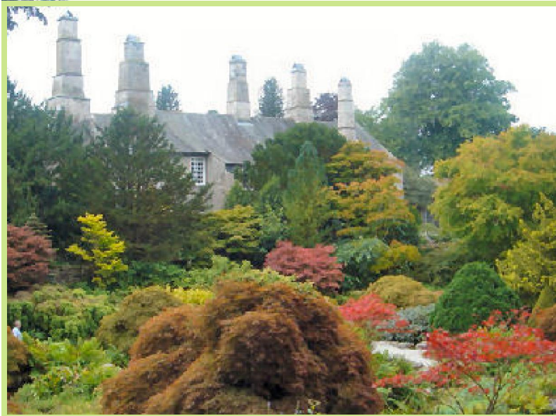
Sizergh Castle and Gardens

After being fed and watered we set off for the very short journey to Sizergh Castle. The castle is National Trust property and the home of the Strickland family for 700 years. The staff couldn't have been more welcoming and helpful. We all split up to make our own way